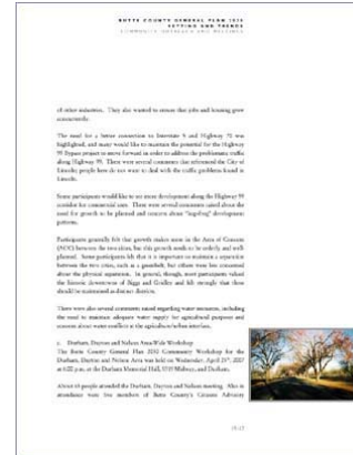
Pages from the Setting and Trends Report

Butte County Development Services staff is pleased to announce the release of the “ Butte County General Plan 2030 Setting and Trends Report Public Draft. ” Previously referred to as the “Background Report” for the Butte County General Plan 2030 update, the new title reflects this document’s main purpose, to describe Butte County’s existing setting within 19 different subject areas, and to describe trends in growth and development throughout the County. Chapter 19 of the Setting and Trends Report is devoted to the community meeting and outreach process, and provides summaries for each of the 19 community meetings