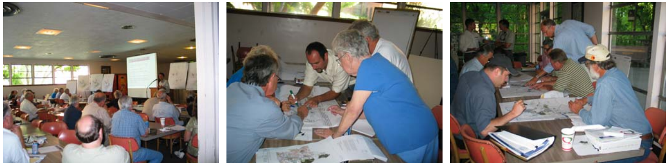
August 2, 2007 Citizens Advisory Committee Meeting, CSU Chico

For the Board's convenience, the following provides an overview of important dates and meetings for Meeting Series #2/3: