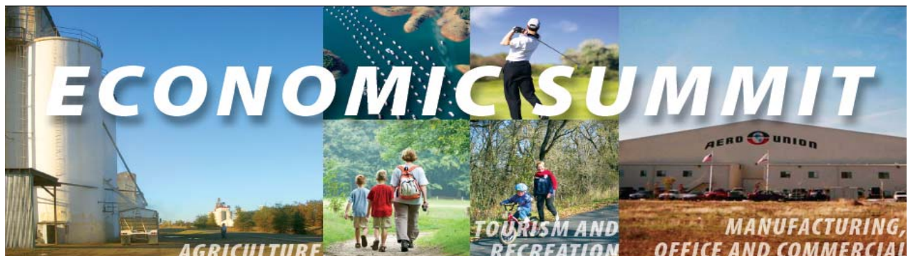
From: Butte County General Plan 2030 Economic Summit Brochure

An Opportunity for Butte County's Economic Future and You!